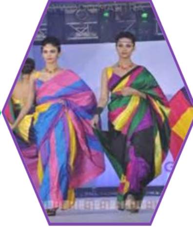
Fashion show by Dillard's